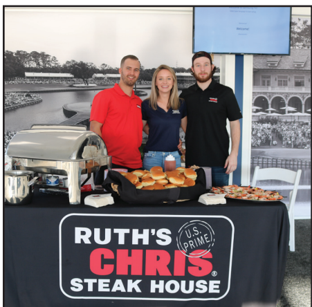
Ruth's Chris Steak House had some tasty offerings at the event.