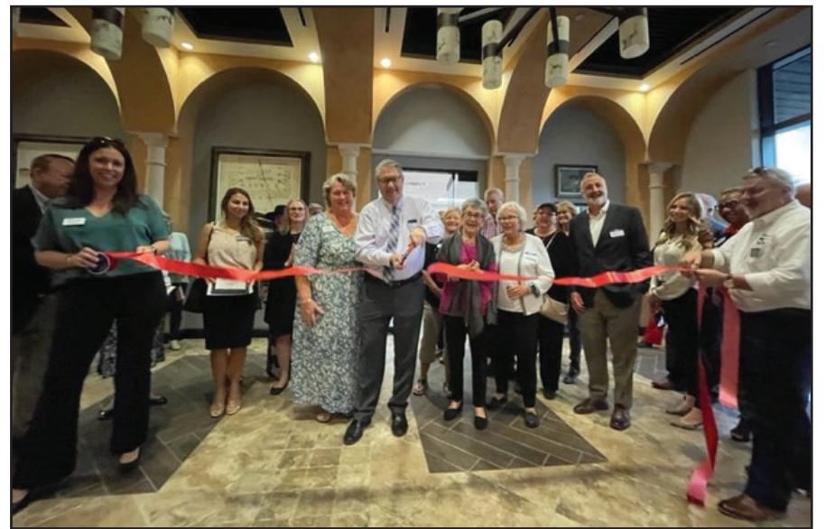
Ponte Vedra Beach Division Intelligent Office joined the St. Johns County Chamber of Commerce with a ribbon cutting and after-hours event Feb. 23.