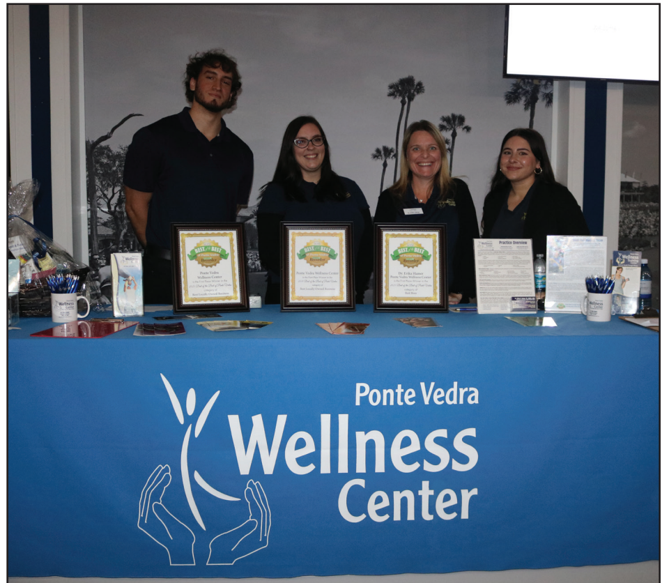
The crew from the Ponte Vedra Wellness Center had a table at the event.