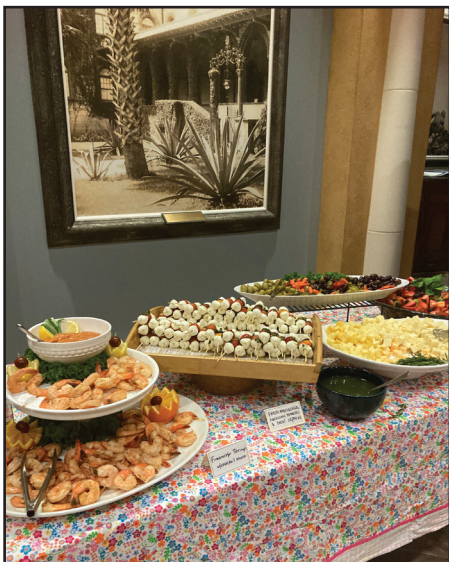
Food for the event was provided by Mangroves Catering in Ponte Vedra Beach.