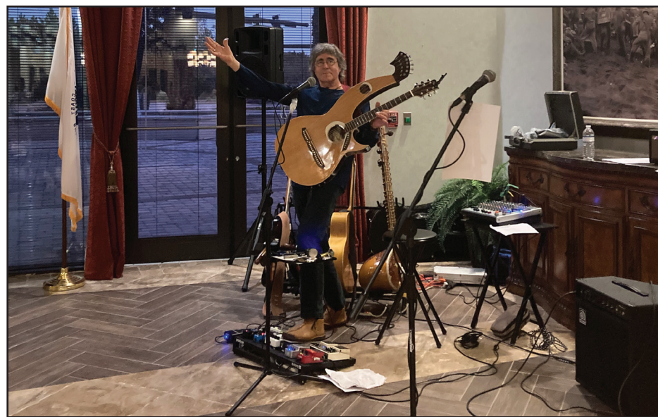
Music was provided as part of the after-hours networking event.