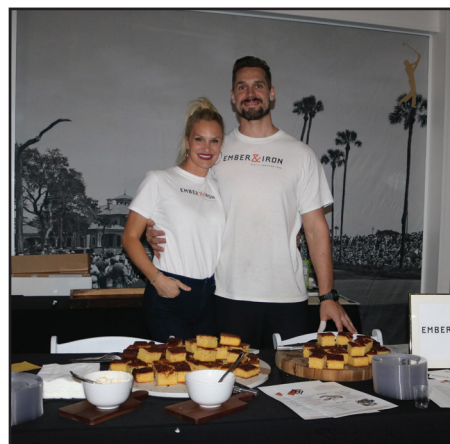
Ember & Iron