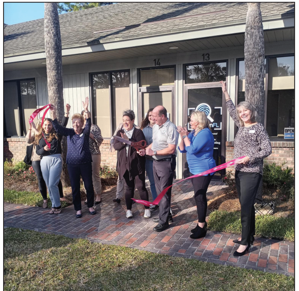
The St. Johns County Chamber of Commerce Ponte Vedra Beach Division held a ribbon cutting ceremony for ScanManFL Feb. 17.

Evening and weekend hours can be scheduled by appointment, which includes taking the fingerprinting material mobile and going off site to provide the service for groups of 10 or more of a certain company or organization.