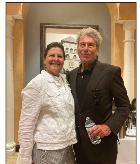
at the event.